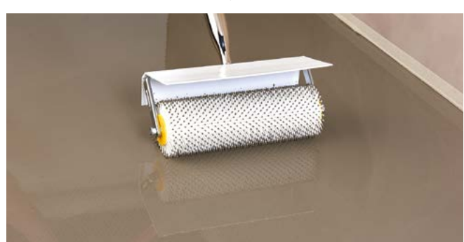
Figure 1 Spiked screed roller

with deviation not exceeding 3mm (in accordance with Annex C -BS8203 : 2017) when measured the same way as above.